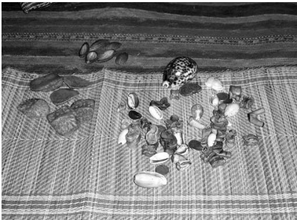
Figure 1 – A complete current tinhlolo set (2005).

Two of the sets are considered by their users to be variations of the same divination set and method, which existed prior to the Nguni invasions of southern Mozambique in the nineteenth century. 5 Both have six similar elements: in one case, the so-called tinguenha , the pieces are crocodile back scales; in the other, the thiakata , they are nut shells from a tree called nulu , which plays an important role in the treatment of people diagnosed as spirit-possessed. 6 They