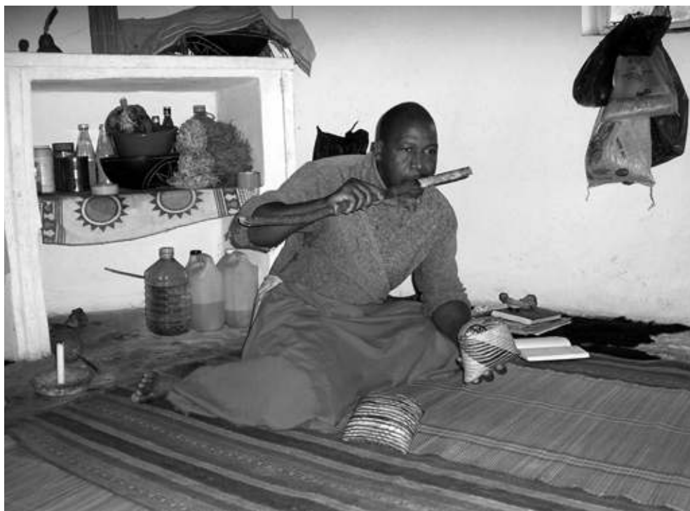
Figure 3 – Biting manono wood, to help inducing light trance .

The spirit is then asked to make a kuvumbata (prophecy) for the client, who is identified by his name and ascendant kin back two or three generations. Subsequently, the diviner bites a branch of manono , a highly sour wood which helps him to induce what is usually called a “light trance”, or a “mild trance” (figure 3).