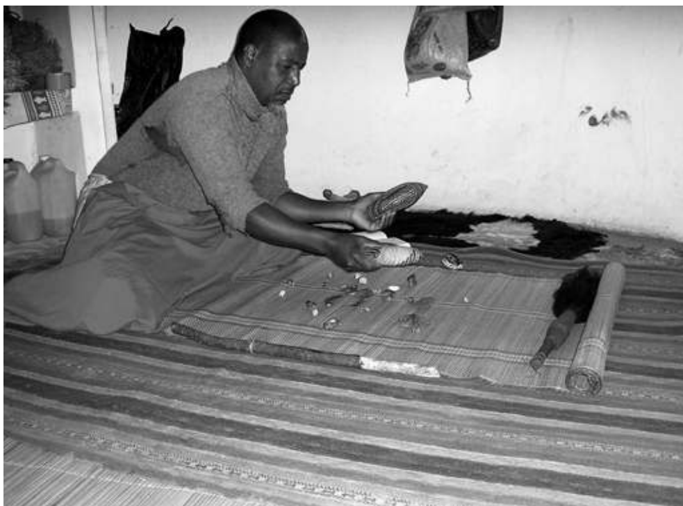
Figure 4 – Throwing the complete tinhlolo .

Once the diviner feels the spirit's presence, he can throw the tinhlolo (figure 4). If he is already familiar with his client, he may use only the “Nguni” one; if it is a first or an important consultation (due to a client's high status or due to the expectation of a particularly complicated problem), he will normally “play it safe” by throwing both the crocodile back scales and the nulu nut