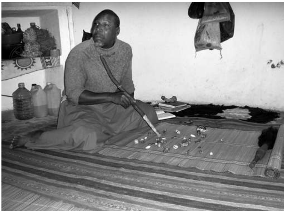
Figure 5 – Explaining the client's problem.

therefore subject to rules of common courtesy – as one must answer a letter, or an oral message, before receiving any return correspondence or communication.